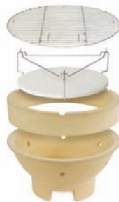
Roasting "Bottom" configuration.