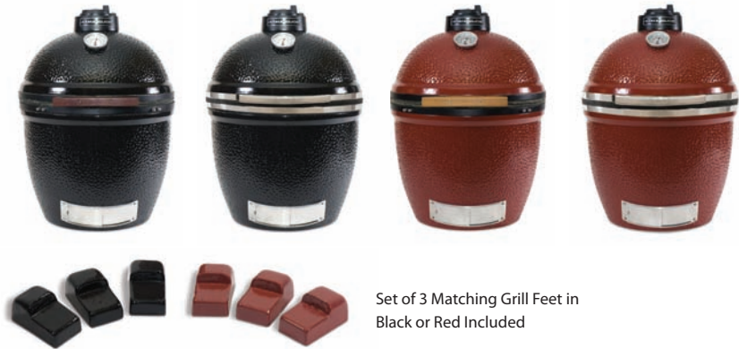
Set of 3 Matching Grill Feet in Black or Red Included

Kamado Joe “Stand Alone” Grills are designed to be used with Kamado Joe Grill Tables or in an outdoor kitchen. They carry the same materials, quality and dimensions as our standard configuration, with the elimination of the side shelves and cart.